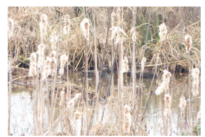
American Black Duck by Yves Limpalair