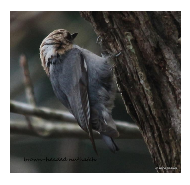
Brown-headed Nuthatch